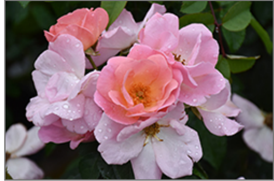
Peachy Knock Out Rose flowers

Peachy Knock Out Rose is a multi-stemmed deciduous shrub with an upright spreading habit of growth. Its average texture blends into the landscape, but can be balanced by one or two finer or coarser trees or shrubs for an effective composition.