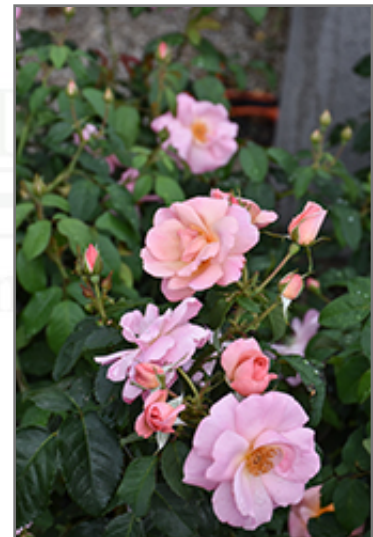
Peachy Knock Out Rose flowers