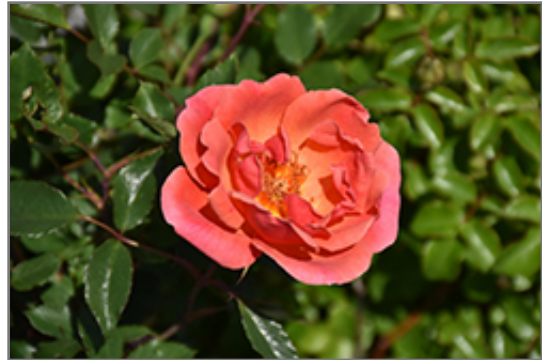
Coral Knock Out Rose flowers

Coral Knock Out Rose is a multi-stemmed deciduous shrub with a more or less rounded form. Its average texture blends into the landscape, but can be balanced by one or two finer or coarser trees or shrubs for an effective composition.