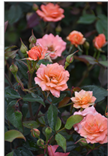
Coral Knock Out Rose flowers