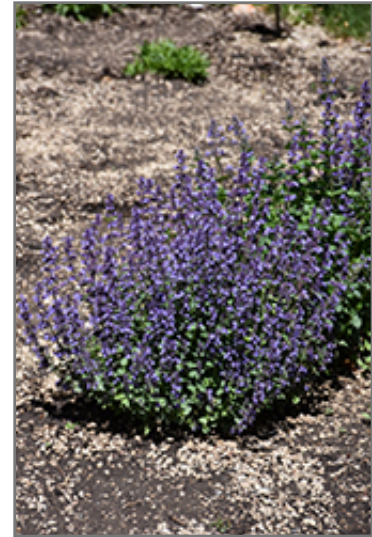
Cat's Pajamas Catmint in bloom

Cat's Pajamas Catmint is a fine choice for the garden, but it is also a good selection for planting in outdoor pots and containers. It is often used as a 'filler' in the 'spiller-thriller-filler' container combination, providing a mass of flowers against which the thriller plants stand out. Note that when growing plants in outdoor containers and baskets, they may require more frequent waterings than they would in the yard or garden. Be aware that in our climate, most plants cannot be expected to survive the winter if left in containers outdoors, and this plant is no exception. Contact our experts for more information on how to protect it over the winter months.