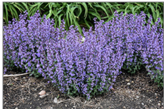
Cat's Pajamas Catmint in bloom