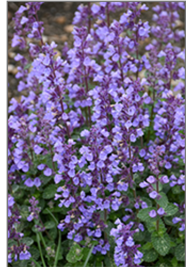
Cat's Pajamas Catmint flowers

Cat's Pajamas Catmint is a dense herbaceous perennial with a mounded form. Its relatively fine texture sets it apart from other garden plants with less refined foliage.