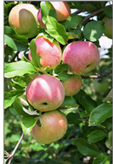
Northern Spy Apple fruit

Northern Spy Apple features showy clusters of lightly-scented white flowers with shell pink overtones along the branches in mid spring, which emerge from distinctive pink flower buds. It has forest green deciduous foliage. The pointy leaves turn yellow in fall. The fruits are showy chartreuse apples with a scarlet blush, which are carried in abundance in late summer. The fruit can be messy if allowed to drop on the lawn or walkways, and may require occasional clean-up.