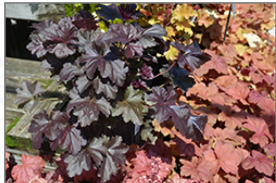
Obsidian Coral Bells