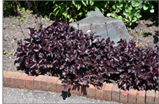
Obsidian Coral Bells

Obsidian Coral Bells is recommended for the following landscape applications;