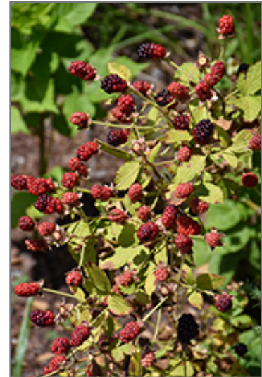
Baby Cakes Blackberry fruit