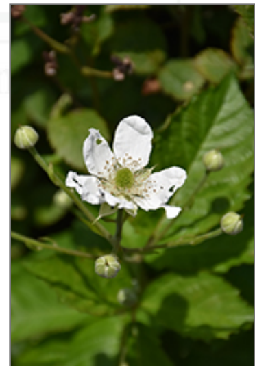
Baby Cakes Blackberry flowers