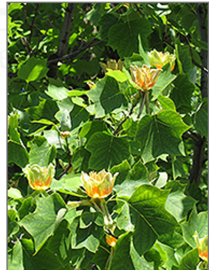
Tuliptree flowers