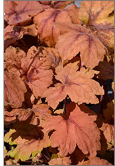
Pumpkin Spice Foamy Bells foliage

This is a relatively low maintenance plant, and should be cut back in late fall in preparation for winter. It is a good choice for attracting hummingbirds to your yard. It has no significant negative characteristics.