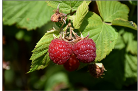
Nova Raspberry fruit