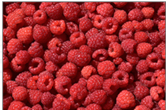
Nova Raspberry fruit