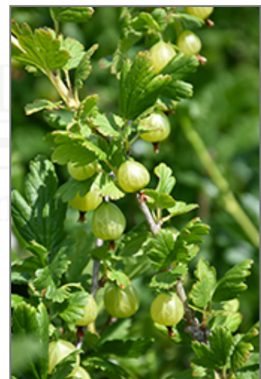
Captivator Gooseberry fruit