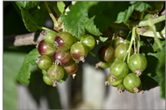
Captivator Gooseberry fruit