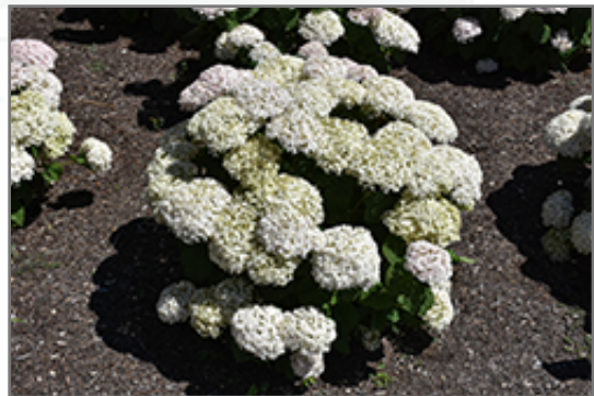
Invincibelle Wee White Hydrangea in bloom