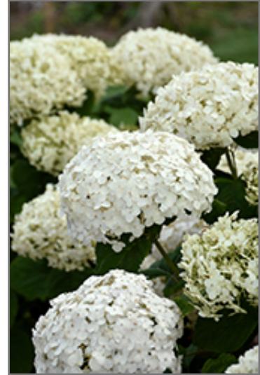
Invincibelle Wee White Hydrangea flowers

Invincibelle Wee White Hydrangea is recommended for the following landscape applications;