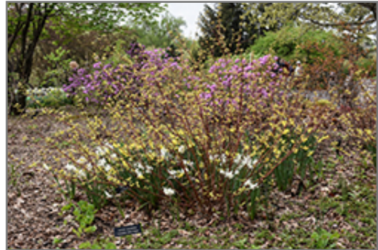
Neon Burst Dogwood in spring

This shrub does best in full sun to partial shade. It is an amazingly adaptable plant, tolerating both dry conditions and even some standing water. It is not particular as to soil type or pH. It is highly tolerant of urban pollution and will even thrive in inner city environments. This is a selected variety of a species not originally from North America.