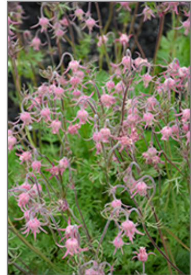
Prairie Smoke flowers

Prairie Smoke is an herbaceous perennial with an upright spreading habit of growth. Its relatively fine texture sets it apart from other garden plants with less refined foliage.