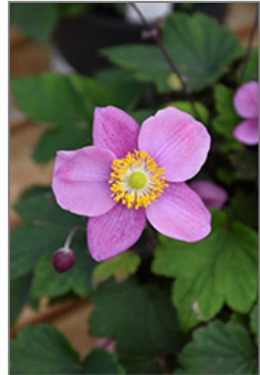
September Charm Anemone flowers

September Charm Anemone is recommended for the following landscape applications;