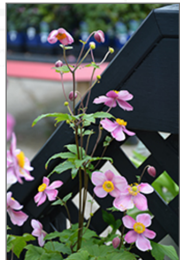
September Charm Anemone flowers