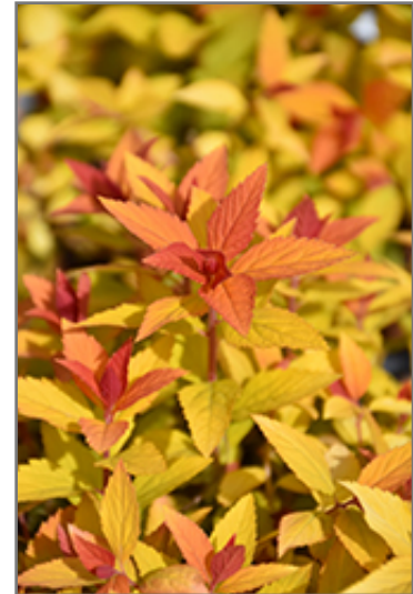
Double Play Candy Corn Spirea foliage

This shrub will require occasional maintenance and upkeep, and is best pruned in late winter once the threat of extreme cold has passed. It is a good choice for attracting butterflies to your yard, but is not particularly attractive to deer who tend to leave it alone in favor of tastier treats. It has no significant negative characteristics.