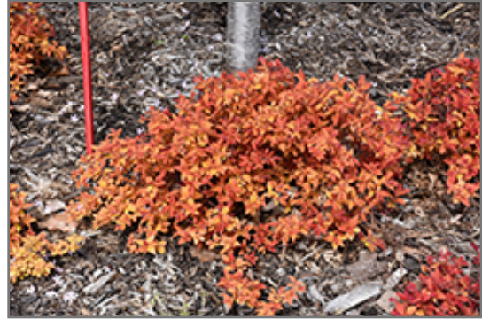
Double Play Candy Corn Spirea

Double Play Candy Corn Spirea will grow to be about 24 inches tall at maturity, with a spread of 30 inches. It tends to fill out right to the ground and therefore doesn't necessarily require facer plants in front. It grows at a fast rate, and under ideal conditions can be expected to live for approximately 20 years.