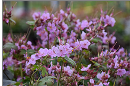
Ingerwesen's Variety Cranesbill flowers

Ingerwesen's Variety Cranesbill is recommended for the following landscape applications;