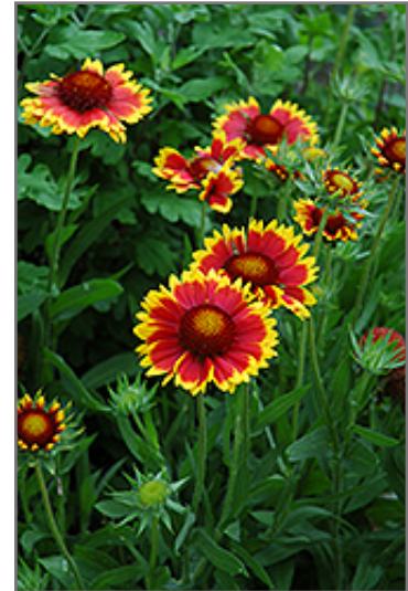
Goblin Blanket Flower flowers

Tomato-red daisy like flowers with golden yellow edges stand above mounds of gray-green foliage on these compact plants; excellent for borders, beds, containers and cutting gardens; drought and heat tolerant requiring little maintenance