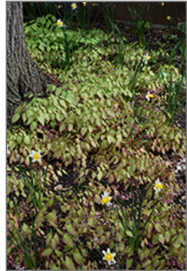
Bishop's Hat in bloom