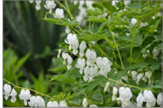
White Bleeding Heart flowers

White Bleeding Heart is recommended for the following landscape applications;