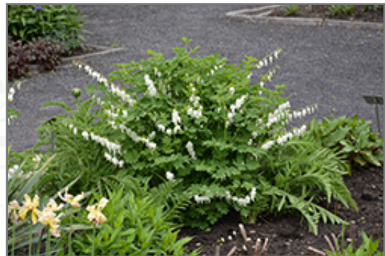
White Bleeding Heart in bloom