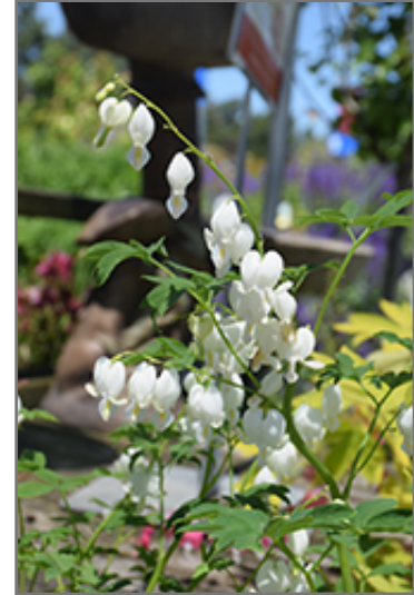
White Bleeding Heart flowers

This plant does best in partial shade to shade. It prefers to grow in average to moist conditions, and shouldn't be allowed to dry out. It is not particular as to soil pH, but grows best in rich soils. It is somewhat tolerant of urban pollution. Consider applying a thick mulch around the root zone over the growing season to conserve soil moisture. This is a selected variety of a species not originally from North America. It can be propagated by division; however, as a cultivated variety, be aware that it may be subject to certain restrictions or prohibitions on propagation.