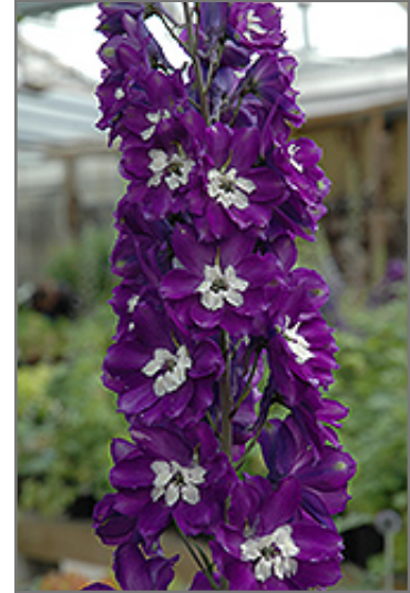
Pacific Giant King Arthur Larkspur flowers

This plant will require occasional maintenance and upkeep, and should be cut back in late fall in preparation for winter. It is a good choice for attracting bees, butterflies and hummingbirds to your yard. Gardeners should be aware of the following characteristic(s) that may warrant special consideration;