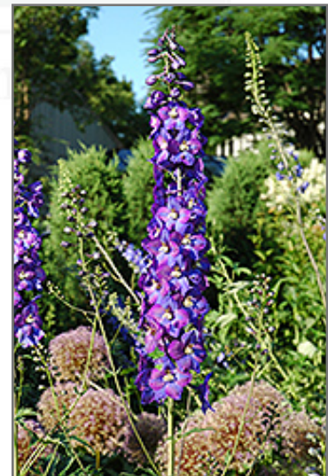
Pacific Giant King Arthur Larkspur flowers