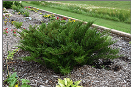
Savin Juniper

Savin Juniper is recommended for the following landscape applications;