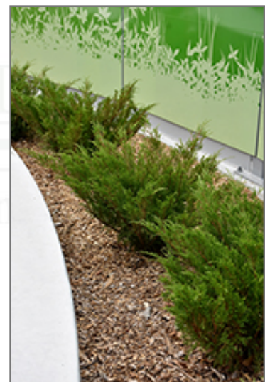
Savin Juniper