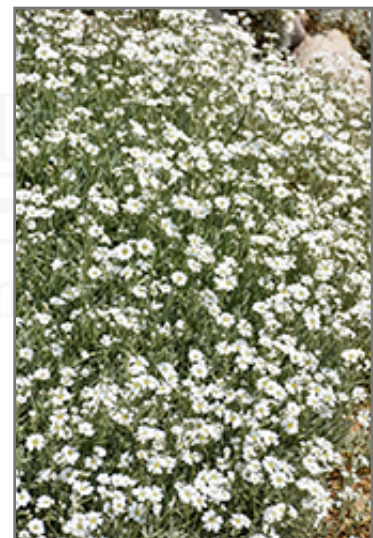
Snow-In-Summer in bloom