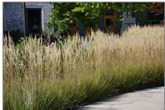
Karl Foerster Reed Grass in bloom