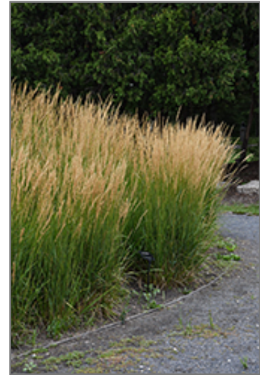
Karl Foerster Reed Grass in bloom

Karl Foerster Reed Grass is a fine choice for the garden, but it is also a good selection for planting in outdoor pots and containers. With its upright habit of growth, it is best suited for use as a 'thriller' in the 'spiller-thriller-filler' container combination; plant it near the center of the pot, surrounded by smaller plants and those that spill over the edges. It is even sizeable enough that it can be grown alone in a suitable container. Note that when growing plants in outdoor containers and baskets, they may require more frequent waterings than they would in the yard or garden. Be aware that in our climate, most plants cannot be expected to survive the winter if left in containers outdoors, and this plant is no exception. Contact our experts for more information on how to protect it over the winter months.