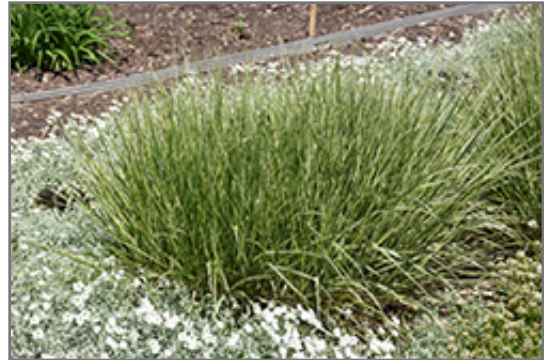
Variegated Reed Grass

Variegated Reed Grass is an herbaceous perennial with an upright spreading habit of growth. It brings an extremely fine and delicate texture to the garden composition and should be used to full effect.