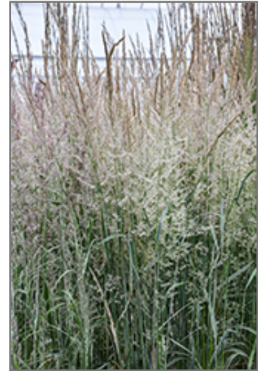
Variiegated Reed Grass flowers

Variiegated Reed Grass is a fine choice for the garden, but it is also a good selection for planting in outdoor pots and containers. With its upright habit of growth, it is best suited for use as a 'thriller' in the 'spiller-thriller-filler' container combination; plant it near the center of the pot, surrounded by smaller plants and those that spill over the edges. It is even sizeable enough that it can be grown alone in a suitable container. Note that when growing plants in outdoor containers and baskets, they may require more frequent waterings than they would in the yard or garden. Be aware that in our climate, most plants cannot be expected to survive the winter if left in containers outdoors, and this plant is no exception. Contact our experts for more information on how to protect it over the winter months.