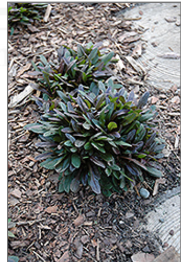
Chocolate Chip Bugleweed