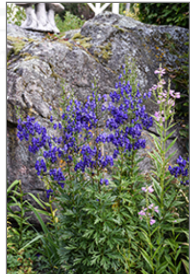
Common Monkshood in bloom