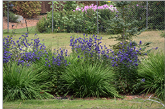
Common Monkshood in bloom