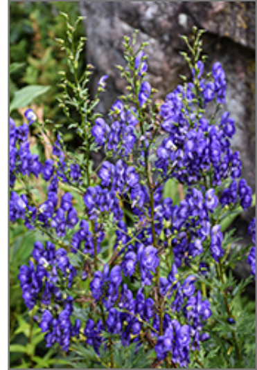
Common Monkshood flowers

Common Monkshood is an herbaceous perennial with a rigidly upright and towering form. Its relatively fine texture sets it apart from other garden plants with less refined foliage.