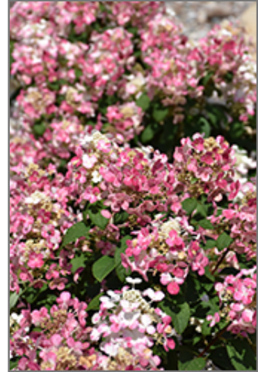
Little Quick Fire Hydrangea flowers

Little Quick Fire Hydrangea is recommended for the following landscape applications;