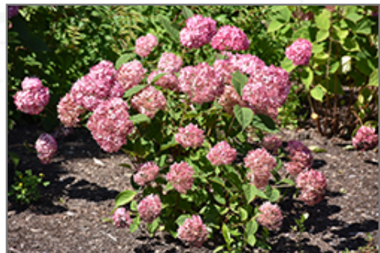
Invincibelle Ruby Hydrangea in bloom