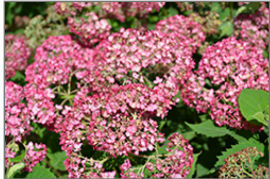
Invincibelle Ruby Hydrangea flowers

This shrub performs well in both full sun and full shade. However, you may want to keep it away from hot, dry locations that receive direct afternoon sun or which get reflected sunlight, such as against the south side of a white wall. It prefers to grow in average to moist conditions, and shouldn't be allowed to dry out. It is not particular as to soil type or pH. It is highly tolerant of urban pollution and will even thrive in inner city environments. Consider applying a thick mulch around the root zone in winter to protect it in exposed locations or colder microclimates. This is a selection of a native North American species.