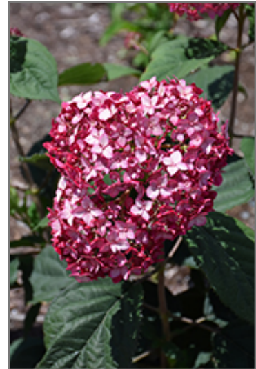
Invincibelle Ruby Hydrangea flowers

This shrub will require occasional maintenance and upkeep, and is best pruned in late winter once the threat of extreme cold has passed. It has no significant negative characteristics.