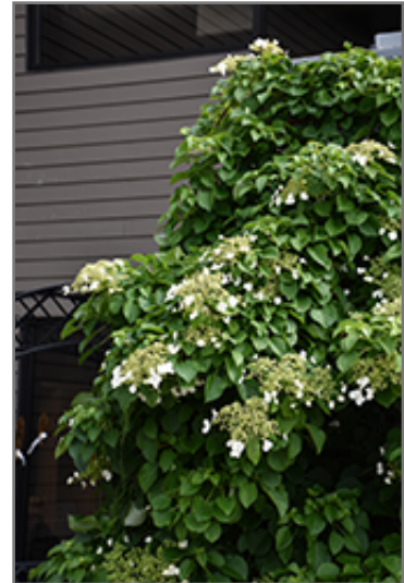
Climbing Hydrangea flowers

This woody vine performs well in both full sun and full shade. It prefers to grow in average to moist conditions, and shouldn't be allowed to dry out. It is not particular as to soil type or pH. It is highly tolerant of urban pollution and will even thrive in inner city environments. Consider applying a thick mulch around the root zone in winter to protect it in exposed locations or colder microclimates. This is a selected variety of a species not originally from North America.