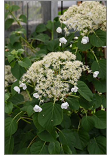
Climbing Hydrangea flowers