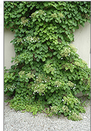
Climbing Hydrangea in bloom