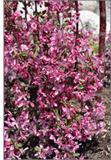
Royal Beauty Flowering Crab flowers

Royal Beauty Flowering Crab is recommended for the following landscape applications;