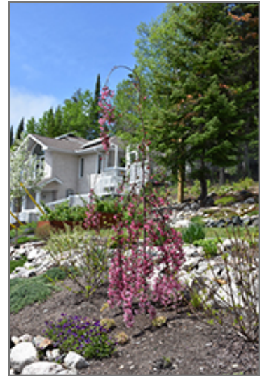
Royal Beauty Flowering Crab in bloom

This shrub should only be grown in full sunlight. It prefers to grow in average to moist conditions, and shouldn't be allowed to dry out. It is not particular as to soil type or pH. It is highly tolerant of urban pollution and will even thrive in inner city environments. This particular variety is an interspecific hybrid.