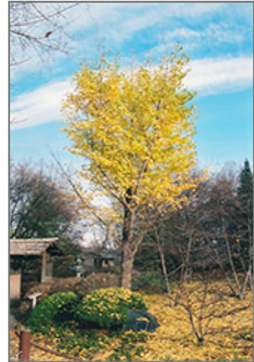
Ginkgo in fall

This tree should only be grown in full sunlight. It is very adaptable to both dry and moist locations, and should do just fine under average home landscape conditions. It is not particular as to soil type or pH, and is able to handle environmental salt. It is highly tolerant of urban pollution and will even thrive in inner city environments. Consider applying a thick mulch around the root zone in winter to protect it in exposed locations or colder microclimates. This species is not originally from North America.