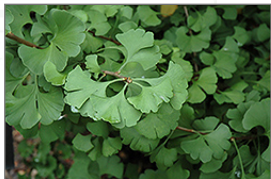
Ginkgo foliage