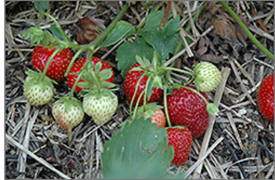
Veestar Strawberry fruit

Veestar Strawberry features dainty white cup-shaped flowers with lemon yellow eyes along the stems in mid spring. Its crinkled round compound leaves remain dark green in colour throughout the season. It features an abundance of magnificent red berries from late spring to early summer.