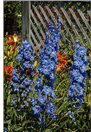
Cobalt Dreams Larkspur flowers

Cobalt Dreams Larkspur is recommended for the following landscape applications;