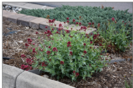
Red Valerian in bloom