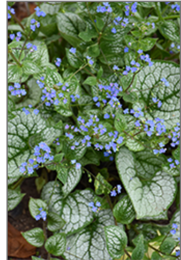
Sea Heart Bugloss flowers

This is a relatively low maintenance plant, and should be cut back in late fall in preparation for winter. It has no significant negative characteristics.