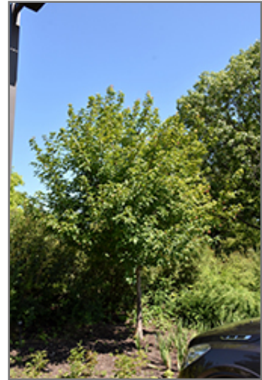
Ruby Slippers Amur Maple

This tree does best in full sun to partial shade. It is very adaptable to both dry and moist locations, and should do just fine under average home landscape conditions. It is not particular as to soil type or pH. It is highly tolerant of urban pollution and will even thrive in inner city environments. This is a selected variety of a species not originally from North America.