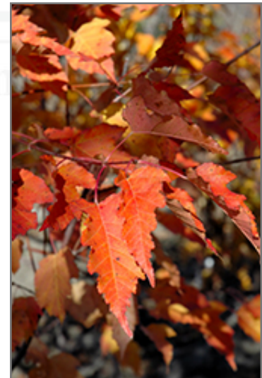
Ruby Slippers Amur Maple in fall