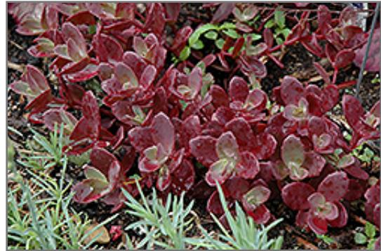
Firecracker Stonecrop foliage

This is a relatively low maintenance plant, and is best cleaned up in early spring before it resumes active growth for the season. It is a good choice for attracting bees and butterflies to your yard, but is not particularly attractive to deer who tend to leave it alone in favor of tastier treats. It has no significant negative characteristics.