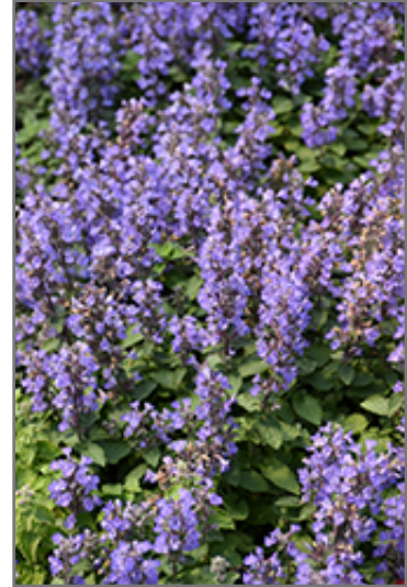
Purrsian Blue Catmint flowers