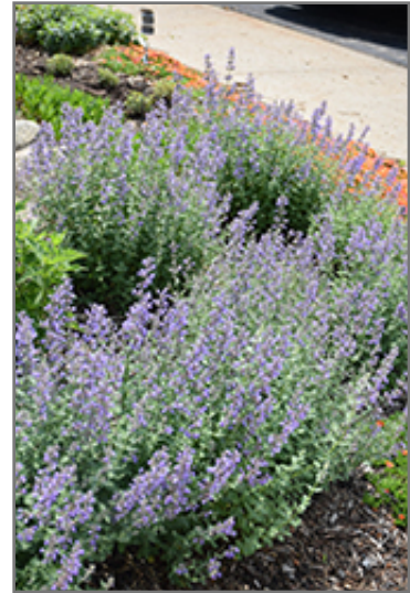
Purrsian Blue Catmint in bloom

Purrsian Blue Catmint is a fine choice for the garden, but it is also a good selection for planting in outdoor pots and containers. It is often used as a 'filler' in the 'spiller-thriller-filler' container combination, providing a mass of flowers against which the thriller plants stand out. Note that when growing plants in outdoor containers and baskets, they may require more frequent waterings than they would in the yard or garden. Be aware that in our climate, most plants cannot be expected to survive the winter if left in containers outdoors, and this plant is no exception. Contact our experts for more information on how to protect it over the winter months.