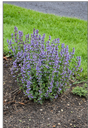
Purrsian Blue Catmint in bloom