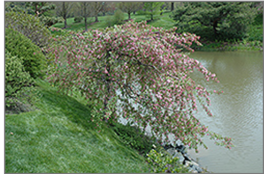
Louisa Flowering Crab in bloom

This tree should only be grown in full sunlight. It prefers to grow in average to moist conditions, and shouldn't be allowed to dry out. It is not particular as to soil type or pH. It is highly tolerant of urban pollution and will even thrive in inner city environments. This particular variety is an interspecific hybrid.