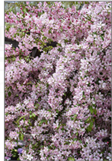
Louisa Flowering Crab flowers