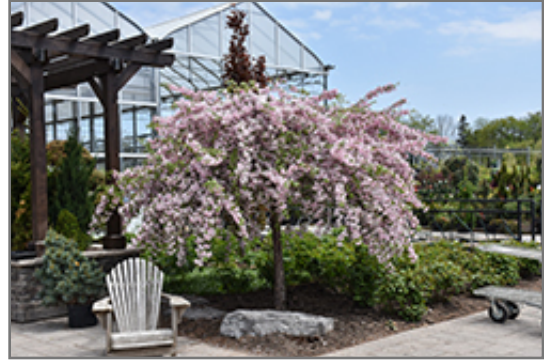
Louisa Flowering Crab in bloom

Louisa Flowering Crab is a deciduous tree with a strong central leader and a rounded form and gracefully weeping branches. Its average texture blends into the landscape, but can be balanced by one or two finer or coarser trees or shrubs for an effective composition.