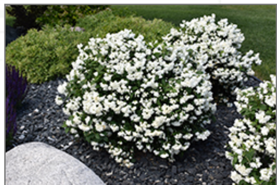
Snowbelle Mockorange in bloom