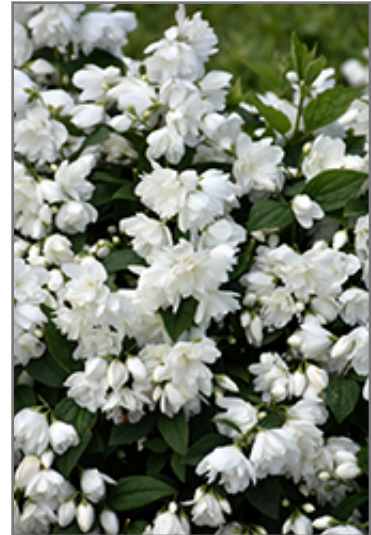
Snowbelle Mockorange flowers

Snowbelle Mockorange is recommended for the following landscape applications;