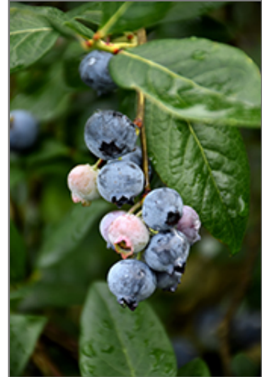
Blue Jay Blueberry fruit

This shrub is typically grown in a designated area of the yard because of its mature size and spread. It does best in full sun to partial shade. It does best in average to evenly moist conditions, but will not tolerate standing water. It is very fussy about its soil conditions and must have sandy, acidic soils to ensure success, and is subject to chlorosis (yellowing) of the foliage in alkaline soils. It is quite intolerant of urban pollution, therefore inner city or urban streetside plantings are best avoided, and will benefit from being planted in a relatively sheltered location. Consider applying a thick mulch around the root zone in winter to protect it in exposed locations or colder microclimates. This is a selection of a native North American species.