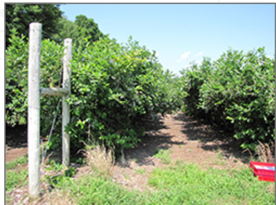
Blue Jay Blueberry fruit