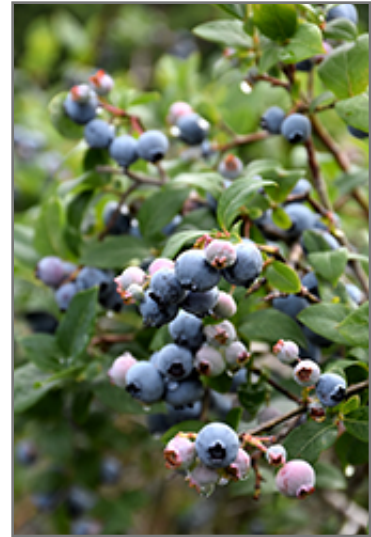
Blue Jay Blueberry fruit