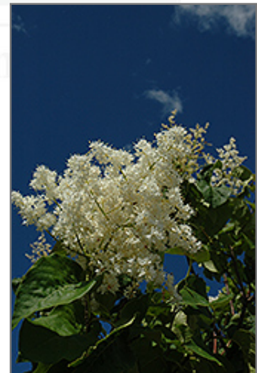
Ivory Pillar Japanese Tree Lilac flowers