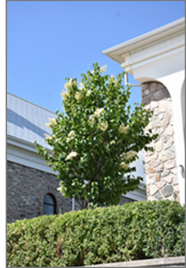
Ivory Pillar Japanese Tree Lilac in bloom

Ivory Pillar Japanese Tree Lilac is recommended for the following landscape applications;