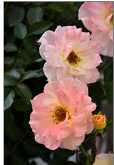
Oso Easy Italian Ice Rose flowers