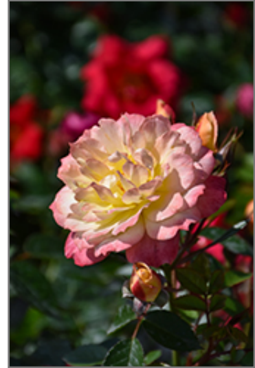
Oso Easy Italian Ice Rose flowers

Oso Easy Italian Ice Rose is recommended for the following landscape applications;