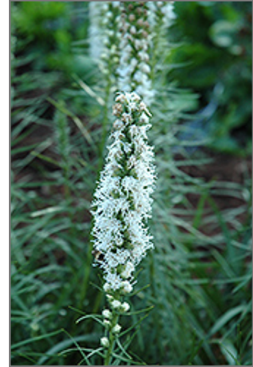
White Blazing Star flowers