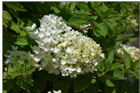
Bombshell Hydrangea flowers