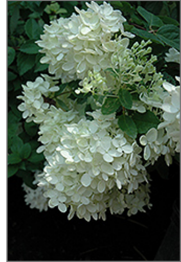
Bombshell Hydrangea flowers

This shrub performs well in both full sun and full shade. It prefers to grow in average to moist conditions, and shouldn't be allowed to dry out. It is not particular as to soil type or pH. It is highly tolerant of urban pollution and will even thrive in inner city environments. Consider applying a thick mulch around the root zone in winter to protect it in exposed locations or colder microclimates. This is a selected variety of a species not originally from North America.