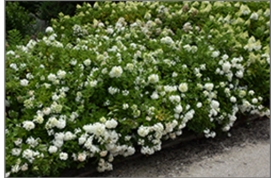
Bombshell Hydrangea in bloom

Bombshell Hydrangea is recommended for the following landscape applications;