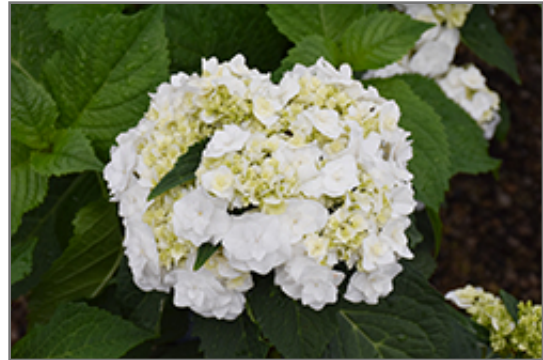
Wedding Gown Hydrangea flowers

Wedding Gown Hydrangea is recommended for the following landscape applications;