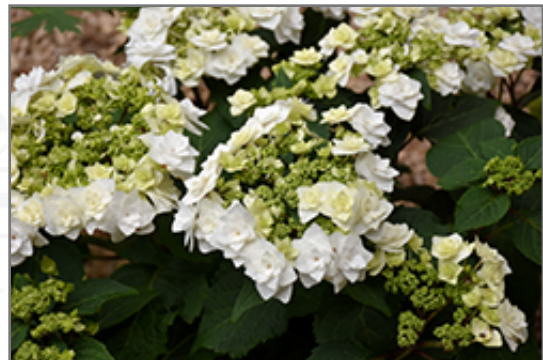
Wedding Gown Hydrangea flowers