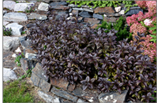
Tango Weigela

Tango Weigela will grow to be about 24 inches tall at maturity, with a spread of 3 feet. It tends to fill out right to the ground and therefore doesn't necessarily require facer plants in front. It grows at a medium rate, and under ideal conditions can be expected to live for approximately 30 years.