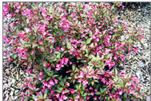
Rumba Weigela in bloom