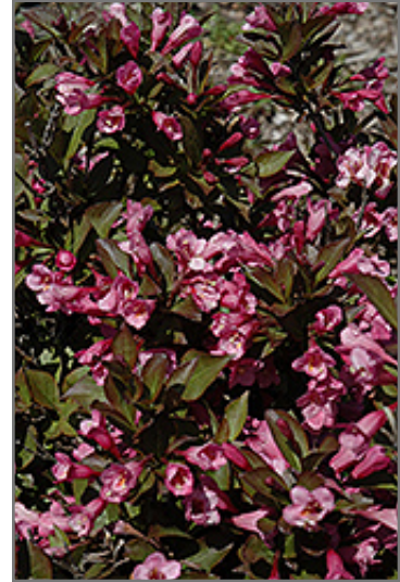
Rumba Weigela flowers

This shrub will require occasional maintenance and upkeep, and should only be pruned after flowering to avoid removing any of the current season's flowers. It is a good choice for attracting hummingbirds to your yard. It has no significant negative characteristics.