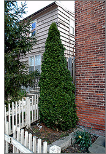
Dark Green Arborvitae