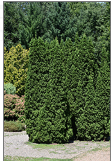
Dark Green Arborvitae