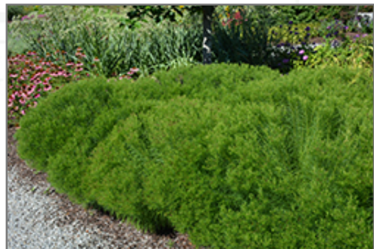
Narrowleaf Ironweed